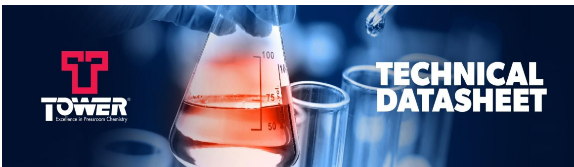
PLATE CLEANER & PRESERVER